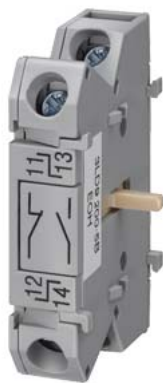
Auxiliary switch, 1 NO+1 NC, accessory for main and emergency switching-off 3LD2 switch front mounting and for molded case switch 3LD5 UL front mounting