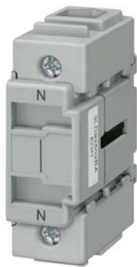
Neutral conductor/PE terminal, continuous, for Front mounting, Up to 32 A, accessory for main and emergency switching-off switch 3LD2