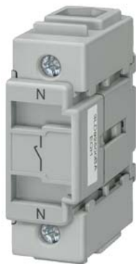
Neutral conductor, leading switching for floor mounting, for 100 A and 125 A, accessory for main and emergency switching-off switch 3LD2