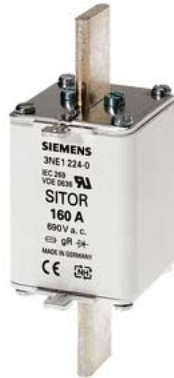
SITOR fuse link, with blade contacts, NH1, In: 160 A, gS, Un AC: 690 V, Un DC: 250 V, front indicator