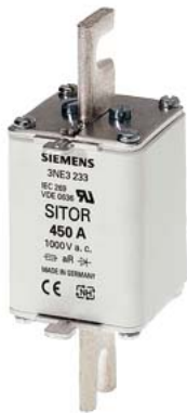
SITOR fuse link, with slotted blade contacts, NH1, In: 450 A, aR, Un AC: 1000 V, front indicator