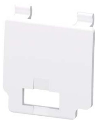
scale cover, sealable for circuit breaker 3RV2 Size S00...S3