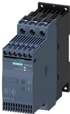
SIRIUS soft starter S0 25 A, 11 kW/400 V, 40 °C 200-480 V AC, 110-230 V AC/DC Screw terminals