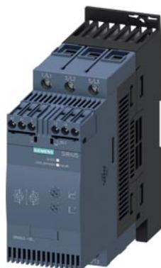
SIRIUS soft starter S2 72 A, 37 kW/400 V, 40 °C 200-480 V AC, 110-230 V AC/DC Screw terminals