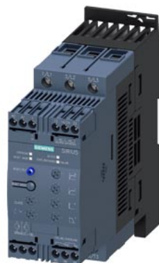
SIRIUS soft starter S2 72 A, 37 kW/400 V, 40 °C 200-480 V AC, 110-230 V AC/DC Screw terminals