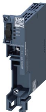
communication module Modbus TCP