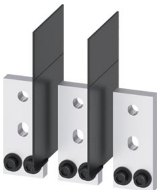
bus connector extended front mounted; 3 units accessory for: 3VA15; 3VA25