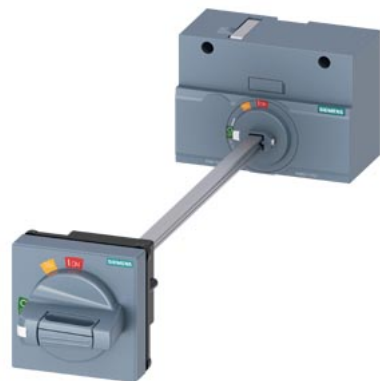
door mounted rotary operator standard IEC IP65 with door interlock accessory for: 3VM12