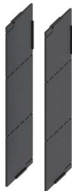
phase barriers; 2 units accessory for: 3VM12