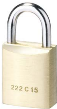
padlock for locking device 5ST3801, 5ST3806 and remote operating mechanism 5ST305.