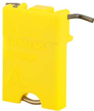
locking device for miniature circuit breaker 5SL, 5SV, 5TL1